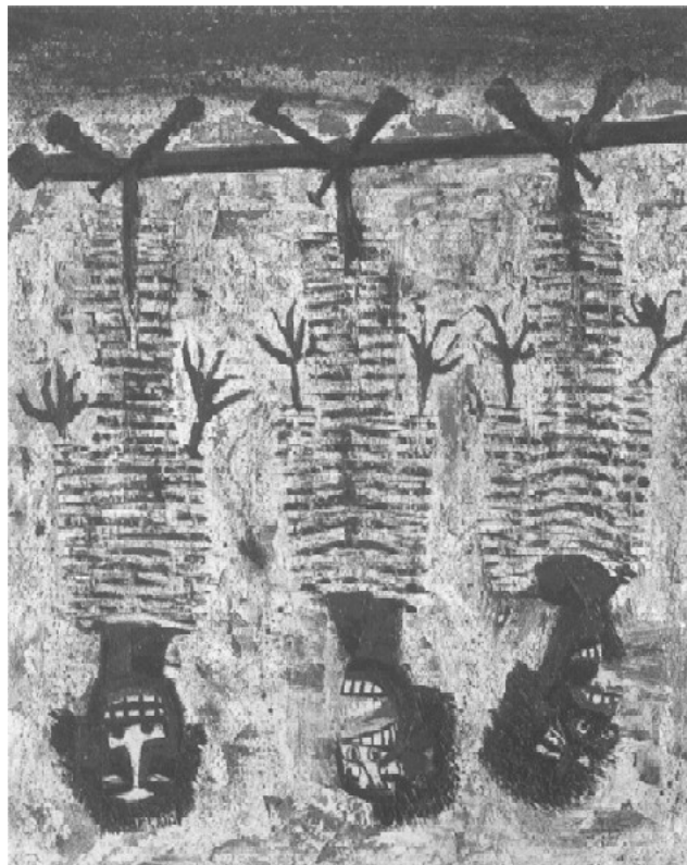
Negotiating Committee for Amnesty , oil on canvas, 1972

"It changes in very subtle ways. You're not conscious of it, but it's reflected in the work. When I was in Maryland, I did some landscapes, which I normally don't do. But the green was so strong that at night, when I got into bed to read, the pages on the book would turn green. They would have this greenish-like glow. That's how strong it was. You've been in the city all these years, and then, all of a sudden, boom! You're out in the middle of the country with trees. After a while, you begin to change.