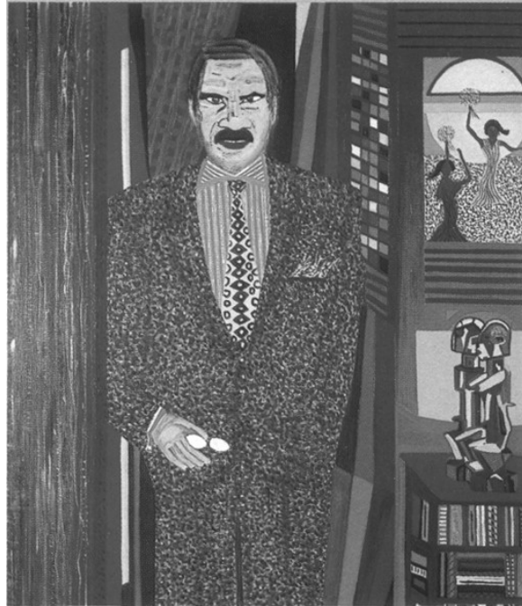
"Portrait of Reginald F. Lewis," oil on canvas, 1998.

"Something told me when I walked into the museum that this was where I belonged," he says. "I always knew that I would do art, but you know how you carry something around with you, and you know that one day it will surface, but you don't know when."