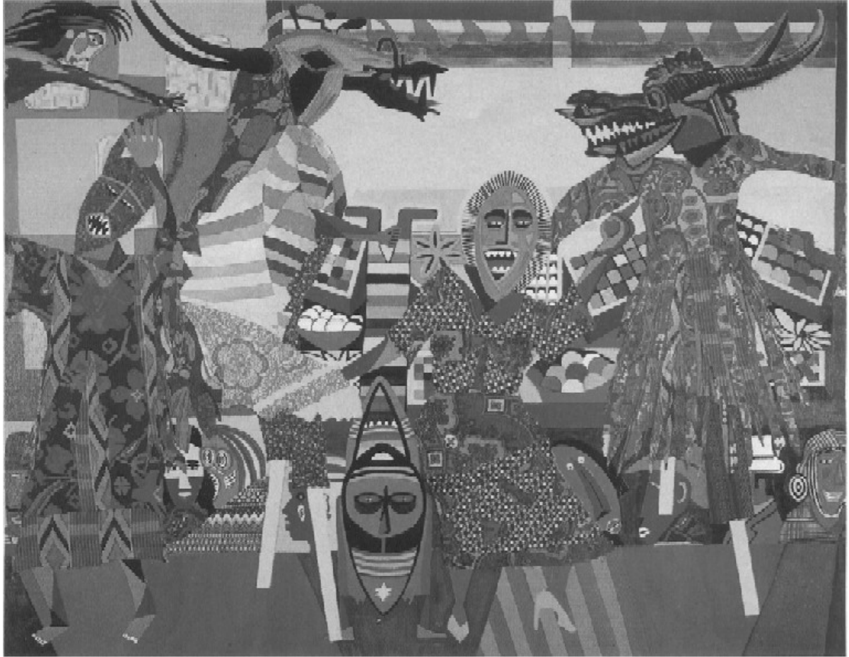
Detail from the mural "Jonkonnu Festival Wid the Frizzly Rooster Band," oil and collage on canvas, 1991.