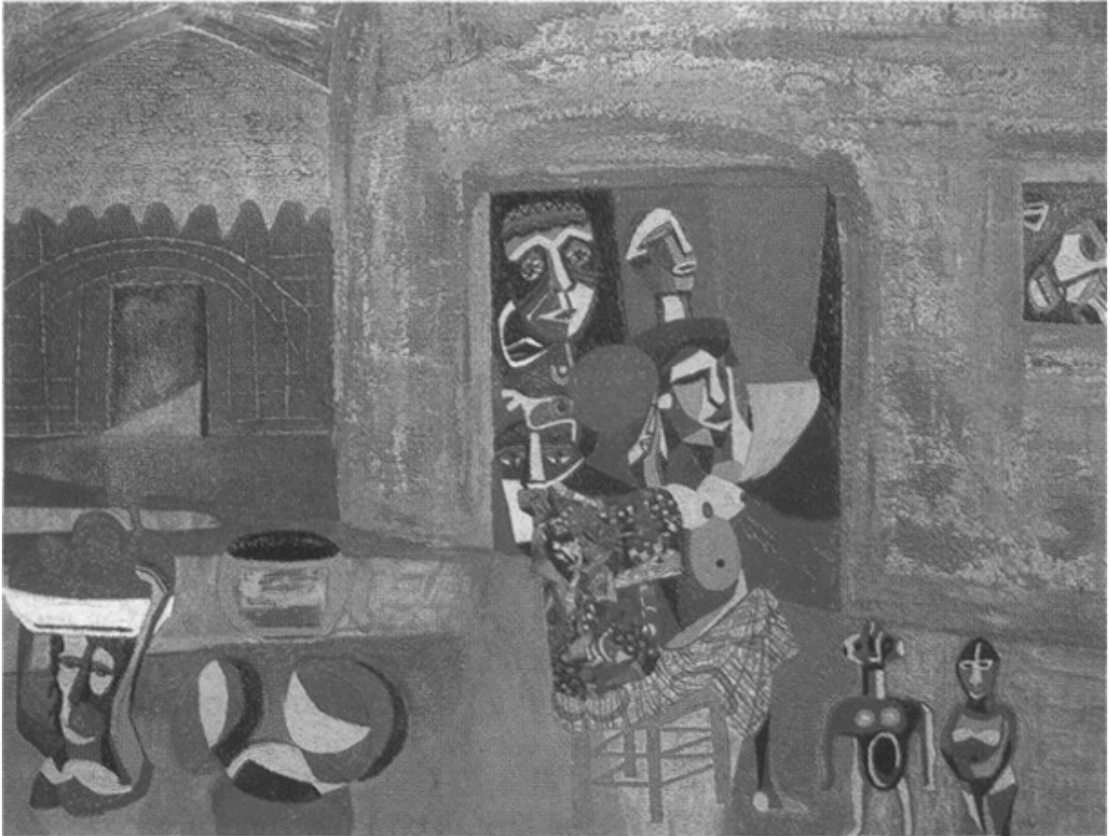
"Makonde Carver," oil and sand on canvas, 1980.