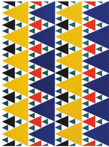
"High Plains" (2012),