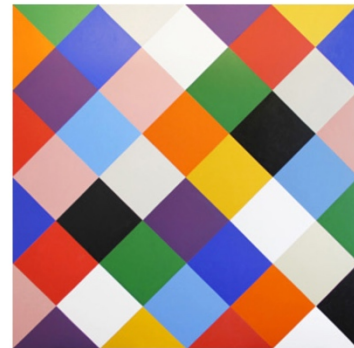
"Time Tells Us What to Do" (2013),